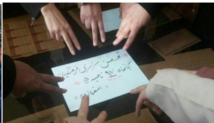
Teachers arrested following country wide sit-in calling for higher wages and more resources for education. November 2018