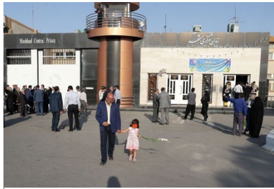
Mashhad Vakilabad Women's Prison. Quds Online, 2020

Meanwhile, prisoners continue to be transferred to court appointments, though in fewer numbers than before. While masks are distributed to prisoners for these appointments, social distancing is not observed. 20