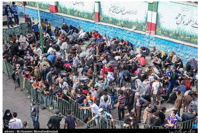
"Flagrant drug users" arrested in Tehran, waiting to be sent to Fashafuyeh Camp on May 10, 2020.

According to the Head of Tehran prisons, drug users were sent to Fashafuyeh because Article 16 detoxification centers ran out of space. 37 The Fashafuyeh Camp is not equipped to meet the medical needs of thousands of people arrested