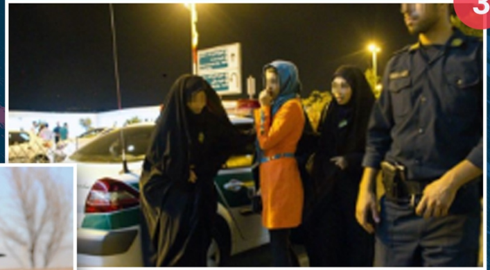
3) 42 women and men arrested in Mazandaran for organizing parties and worshipping Satan. June 13, 2020. Image related to the arrest of 135 boys and girls for having the appearance of Satanists. December 2019.