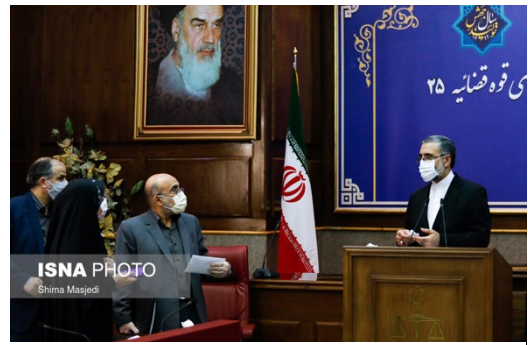
Judiciary spokesman, Gholam Hossein Esmaili

Iranian officials continue to claim that the COVID-19 prevention measures in its prisons are a model for other countries, and that Iran cares for prisoners' health without discrimination. 125 A search for coronavirus on the Judiciary's Human Rights Headquarters brings up multiple results and statistics about the number of prisoners infected in prisons in other countries -- in the US in particular -- but none on the number of people infected in prisons across Iran. 126 Regardless, there is overwhelming evidence to suggest that the Judiciary's new de-crowding directives to send more prisoners on furlough (36,283 between July 8 and July 20, according to the Prison Organization Head Mehdi Haj Mohammadi) 127 are due to a spike in the number of infected prisoners.