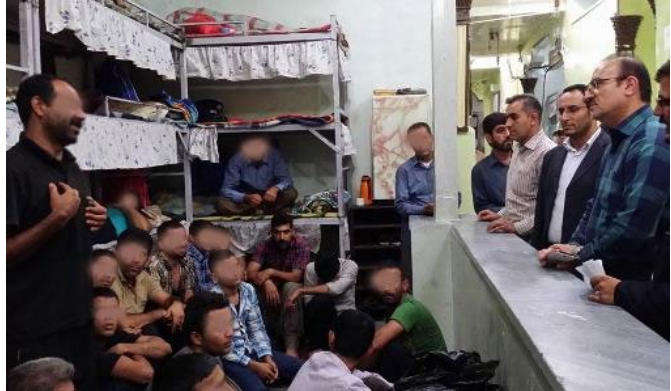
Head of Khuzestan Prisons talking about the urgency of decrowding prisons. 2015.

ABC is not in a position to fully investigate the impact of sanctions on the fight against COVID-19. However, it is clear that the decision not to imprison individuals for petty crimes or crimes that are not recognized under international law, or to release prisoners convicted of non-violent crimes and those with pre-existing health conditions or detained in structures where their health cannot be safeguarded, is an internal policy decision unrelated to trade or banking restrictions. It is a political decision and depends solely on Iranian leaders' will. The possibility of alternative sentences to decrowd prisons 150 has not made a significant difference over the years because of the justice system's punitive outlook and the fact that many judges ignore the judiciary's directives, according to prison officials, 151 and tend to favor imprisonment. A substantial reform of criminal law, a much-needed step repeatedly called for by experts and prison officials, is today more urgent than ever. The pandemic should be a wake-up call for Iranian officials and lawmakers to take the need for structural reforms seriously; but they should not wait for structural reforms to address dangers that threaten citizens right now .