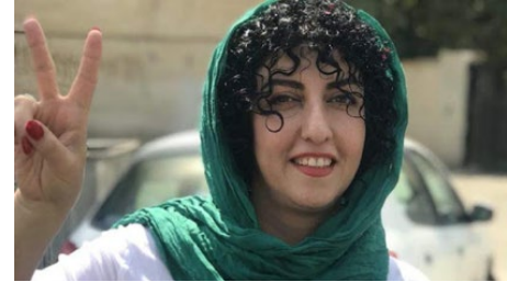
Narges Mohammadi.

“July 5: There are twelve of us in the ward who have come down with the coronavirus. In the last few days since the disease was discovered, they separated us from the healthy people. There are absolutely no facilities or medical care here in the ward. We don’t even have hand sanitizer. They just give out ibuprofen. ... I can’t breathe. The pain is terrible... I’m exhausted. This is how it is for all of us... The guard has said they’ll bring in a doctor: so where are they?”