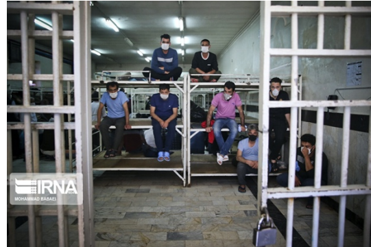
Images of Qezelhesar Prison during COVID-19 pandemic

different rooms corresponding to their entry date for a 15-day quarantine. Sometime in June, newcomers were also tested for the virus with nasal swabs. Still, these prisoners are not fully isolated, as they share hallways and bathrooms with the general population. Only prisoners in critical condition have been taken out of prison for treatment. 59