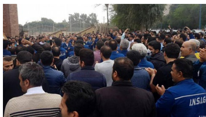
Scores of Ahvaz steel workers protesting unpaid wages arrested. February 2018

Iran can, for example, see to the settlement of unpaid workers' wages, or increase teachers' salaries to allow them a decent standard of living, rather than sending them to unsanitary and overcrowded prisons for speaking out about the state of their professions. 137 A small fraction of what was allocated to Al Mostafa Society could also ensure proper food, hygiene, and medical care for those that the state deprives of liberty.