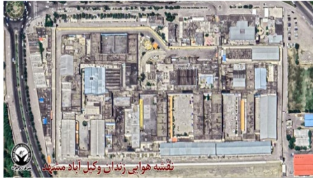
Aerial view of Vakilabad Prison, Mashhad

Hall 1 is a two-story prefabricated building with eight rooms and 700 beds. This hall serves as quarantine for up to 1500 newcomers, some sleeping on the floor and sharing beds, who are held for 21 days before being introduced into the general population. Prisoners receive a towel, a toothbrush and toothpaste, one piece of soap, and a small quantity of washing powder upon arrival; during this period, they share living spaces with prisoners who, upon returning from the hospital, are confined in Hall 1 for two to three weeks before being sent back to their wards. New arrivals are thus held shoulder-to-shoulder with prisoners at all stages of quarantine, rendering ineffective the entire isolation process.