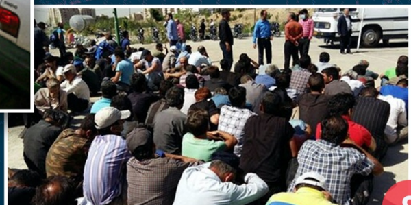
8) 400 foreigners rounded up as "flagrant drug users" and sent to camps awaiting deportation. Khabar Online May 11, 2020