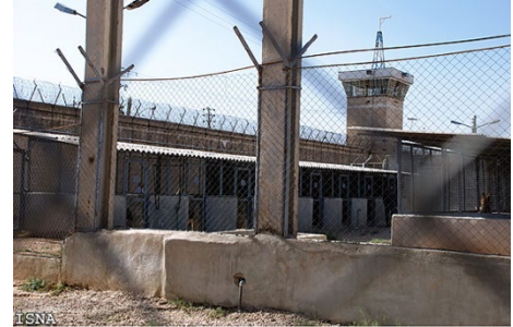
Adelabad Prison, 2020

Prisoners are given one pair of underwear, one toothbrush, and a ration of toothpaste and shampoo. Adelabad's store is small and stocked with a limited quantity of masks, sold at higher prices than outside market price. Masks, gloves, and disinfectants were not distributed to prisoners at the start of the pandemic. At Adelabad, incoming prisoners are held 14-21 days in a quarantine ward with a capacity of 50, in numbers which can reach 200. Prisoners are not segregated by day of arrival. The quarantine facility comprises two big rooms, each with 6-8 triple bunk beds and two phones.