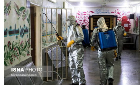
Red Crescent volunteers disinfecting Greater Tehran Prison. April 1, 2020.

In practice, prisoner protection hinges on whether or not they can afford the cleaning and disinfecting products necessary to take prevention measures themselves. Masks are available only for those who can afford to buy them from prison stores. The prison guards, for the most part, wear masks. 27