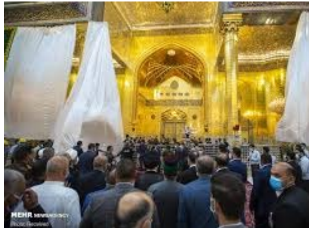
Opening ceremony of the Imam Abbas golden shrine in Karbala, Iraq. August 2020