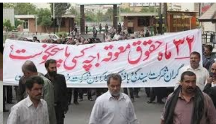
Haft Tapeh sugar cane workers protesting 32 months of unpaid wages, late payment of insurance, lack of protective gear were arrested on their way to take their grievances to Tehran. October 2019.

Soap has been produced in Iran for close to a century, and there is no shortage; on the contrary, it is produced in massive quantities, as evidenced by the fact that there is no black market for it as there is for other commodities. 138 The shortage of disinfectants which has affected many countries, including Iran in March, has also been addressed. Iran has natural resources such as oil and salt, and is producing ethanol, a basic raw material for alcohol-based disinfectants. 139 World Health Organization guidelines for Preparedness, Prevention and Control of COVID-19 in Prisons and Other Places of Detention, meanwhile, specify best practices for decontamination which use chemically simple substances such as soap and diluted bleach. 140 Staff of six hospitals in various cities with knowledge of the medical supply chains told ABC that the fall of the currency has made foreign products unaffordable. These hospitals have been using domestically-produced disinfectants, which are of lower quality than formerly imported foreign products, 141 but are responding to the current needs of hospitals. 142 The fact that prisons do not disinfect the wards or common areas properly, and do not make disinfecting products available without charge to prisoners, is more likely a matter of choice and resource allocation. Ignoring the requests of the Prisons Organization, including for disinfectants, during a