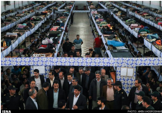
Minister of Health and Head Prison Organization visit Qezelhesar Prison in February 2015.

According to an ABC source, those showing symptoms in the early days of the pandemic were moved to the quarantine ward, where isolation protocols were initially inadequate. Later, the quarantine process became more organized. All newcomers are quarantined for 48 hours together, then moved to