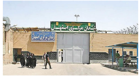
Esfahan Prison. Donya Eghtesad.

pandemic, 110 per Article 659 of the Code of Criminal Procedure, which allows for virtual trial proceedings in certain conditions. 111 But the overall handling of coronavirus concerns in Iranian courts has been inconsistent, and puts both justice and public health at risk. ABC's interviews with prisoners and lawyers in several cities, such as Shiraz, Tehran, and Tabriz, indicate that some non-criminal cases have been handled remotely. 112 In criminal cases, information at hand indicates that prisoners have generally been taken to courts as usual, or that judges have handled court proceedings in ways that have disadvantaged defendants, with the exception of one prisoner in Alborz Province whose case required traveling to Esfahan. 113