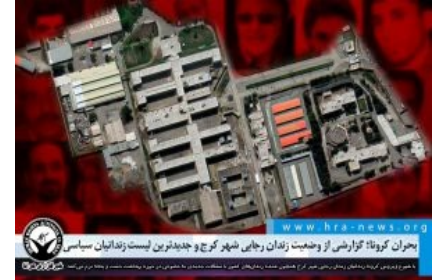
Aerial view of Rajaishahr Prison. HRANA

According to ABC's source, prison authorities have not raised awareness about the coronavirus among incarcerated people, and the disinfection of the hallways, performed once or twice per week, is done with a product which can be mistaken for plain water. The source went on to say that Rajaishahr Prison's initial no-new-entries pandemic policy did not take long to fade from practice: "The policy suddenly changed, and new prisoners were brought in, and those on furlough were brought back..."