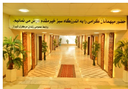
Entrance to the "Green Ward" of Adelabad Prison

Adelabad Prison in Shiraz has 14 regular wards for men convicted of various crimes, excluding drug crimes. Three of these wards are very large. Each of them comprise three 3-story buildings. Each floor has 20 rooms and holds 300 to 400 prisoners. Each room has three or four three-tier bunk beds and prisoners who do not have beds sleep on the floor, in the rooms and the hallways. Every ward has seven to eight bathrooms, each comprising a toilet and a shower. However, these facilities are unsanitary, not all the bathrooms are in service, and hot water is often lacking. 97 The Sabz (Green) Ward has four halls and one of these halls, known as Ward 14 is holding political prisoners. Wards are disinfected daily by prisoners themselves. The Green Ward is better equipped and more comfortable than Adelabad’s other wards. It has daily access to the courtyard while most wards do not have regular and easy access to open air facilities for recreation and may be denied such access for weeks.