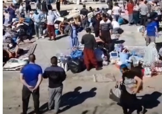
Prisoners moved out of their wards in the Qezelhesar Prison yard, March 12, 2020, from video published by HRANA