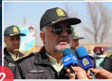
2) Head of Western Tehran Police announces the arrest of 111 men and women for participating in a mixed gender party. April 2020. Ghatreh;