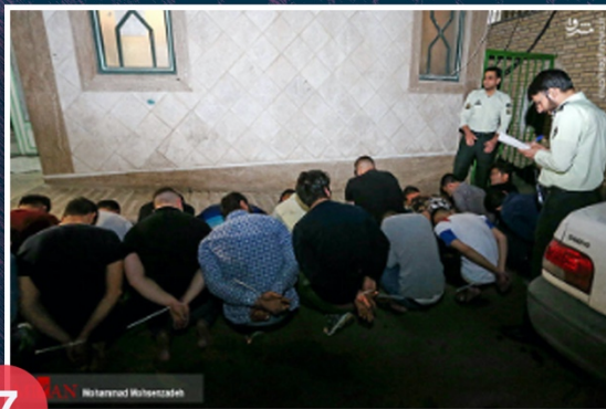
5) "Flagrant drug users" arrested in Tehran, waiting to be sent to Fashafuyeh Camp on May 10, 2020;