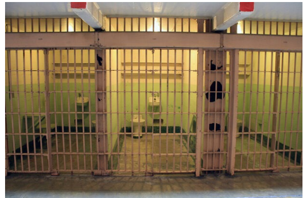
Restroom facilities at Adelabad Prison, Howzeh News Service, 2020

A source with knowledge of Adelabad Prison reports many confirmed COVID-19 cases there stretching back to the early days of the virus' spread. Prison officials, including the head prison guard officer -- who were in contact with prisoners daily -- tested positive, as did a number of prisoners themselves. All COVID-19 positive individuals were taken away from the prison. The source reports that the announcement of these test results, coupled with a lack of action on the part of officials, sparked prison unrest (on the night of March 29, as cited in ABC's April 2020 report) which resulted in the wounding, including breaking of limbs, of a number of prisoners, as well as the forced transfer (exile) of some 700 prisoners to other facilities. 99