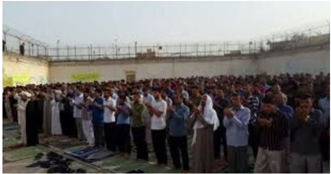
Eid al-Fetr in a Khuzestan prison.

Prisoners are more vulnerable than the general population due to their confinement and dependence on the state. Immediate, concrete, and measurable steps are needed to protect the health and lives of those deprived of liberty as well as prison staff. The most immediate need is a significant reduction of the number of prisoners, without which prevention and containment policies, in particular ensuring physical distancing, will fail. By releasing these prisoners, many of whom do not belong in jail, and ensuring the release into safety of homeless drug users they regularly imprison, Iran will not only abide by its international human rights obligations, but will also take a burden off the limited prisons budget and help improve the conditions for remaining incarcerated people. COVID-19 has already spread in