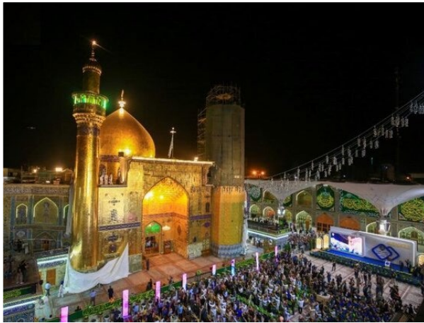
Inauguration of the South Tower of the Imam Ali Shrine in Najaf, Iraq. August 26, 2019, Iranian Student News Agency

Iran’s economy is no doubt suffering from economic sanctions and its leaders have to make hard choices on where to direct the country’s existing resources. Prioritizing religious projects 132 and propaganda, such as the building of golden shrines to Shiite Imams in Iraq, the funding for which was announced by the then Head of the Parliament in January 2016, 133 or the increase in funding for the Al Mostafa Society 134 from approximately 65 million dollars (three years ago) 135 to 73 million dollars (at the official exchange rate), instead of protecting public health in Iran, is a policy choice by Iran’s leadership. Al Mustafa Society’s budget benefits tens of thousands of foreign students studying