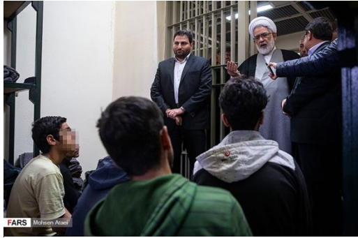
General Prosecutor visiting individuals detained in November 2019 protests.

A source with knowledge of Building 5 in Greater Tehran relates that, by the beginning of August, a previously healthy ward in that building was put under quarantine after seven people took ill with COVID-19 symptoms following the introduction of new incarcerated people. As of that time period, two individuals were being held in a prayer room without medical care after being told there was no room for them in the central prison clinic; one of these, an older man, was in critical condition and could not use the bathroom unassisted. These suspected COVID-19 patients used common toilet and bathing areas. The source reports that the ward for suspect infections is located next to the one holding arrestees from the November 2019