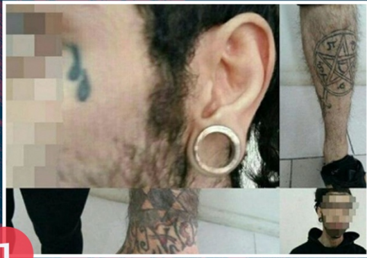
1) 51 men and women arrested in a party in Birjand. Radio Farda;